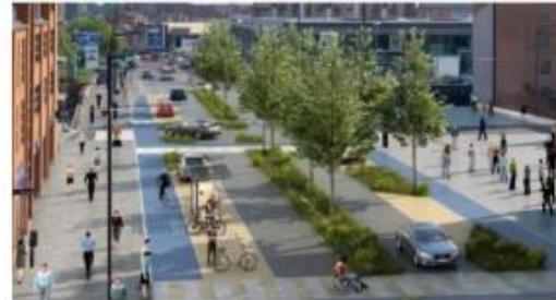
Urban street with space for pedestrians, cyclists and public transport – New Islington, Manchester

Given the reconfiguration of the block and potential reversion of town centre uses, a coordinated servicing strategy will be needed.