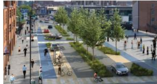
Urban street with space for pedestrians, cyclists and public transport – New Islington, Manchester

Given the reconfiguration of the block and potential reversion of town centre uses, a coordinated servicing strategy will be needed.